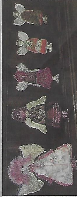
Hooked angels decorating the pews

At the end of an exhausting but thrilling week Heather said: "The delegates were blown away by the unexpected