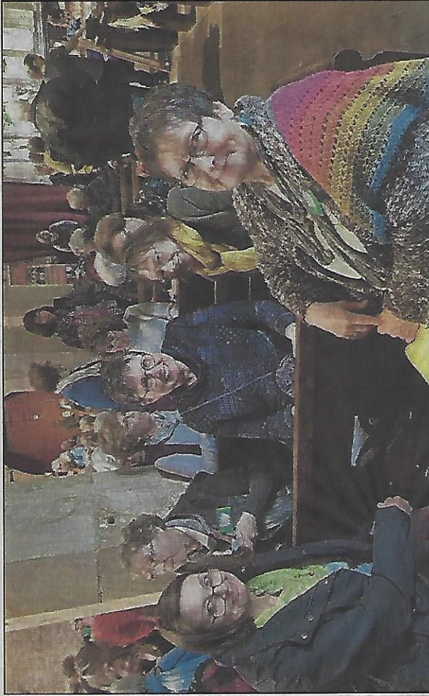
Some of the international delegates

warmth of the welcome they found in the dales. The hospitality was outstanding with many businesses and individuals going out of their way to make sure everything ran smoothly and that the visitors felt at home. From local pubs to the craft group and the planning team everyone went the extra mile to make the convention such a memorable occasion."